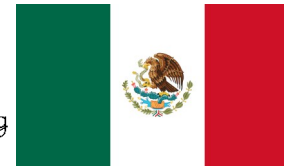
The Mexican flag