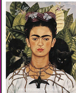
A self-portrait by Frida Kahlo (1940)