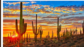
A typical Mexican desert