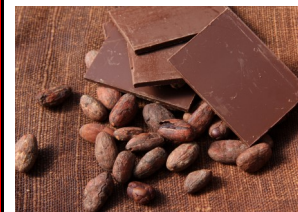
One of Frederick Catherwood's drawings