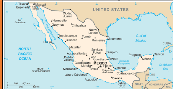
A map of Mexico