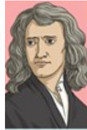
Sir Isaac Newton