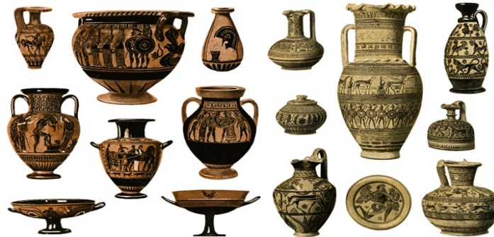
Ancient Greek pottery