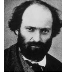
Paul Cezanne and a piece of his artwork.