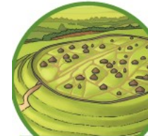
An Iron Age hillfort