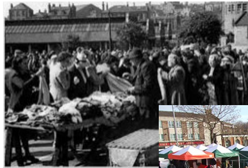
Sneinton Market 1970 and present