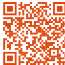
Information about maps