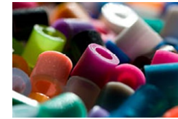
Plastic is smooth.