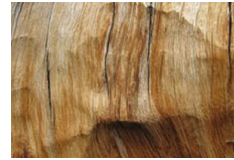
Wood is hard.