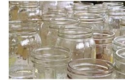
Glass is transparent.