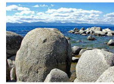
Rock is strong.