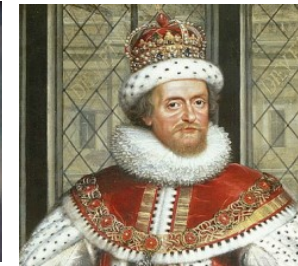
King James I